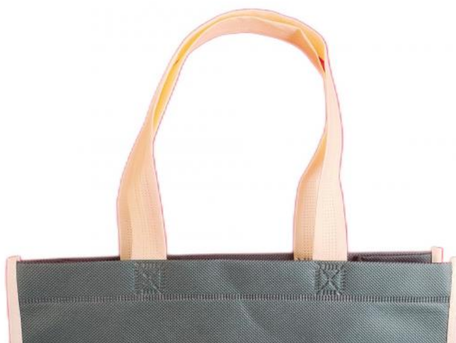
Two-color (Single color) Screen Printing