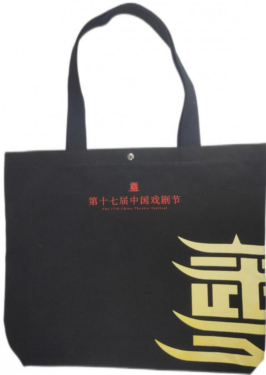
Parallel sewing, firm bottom