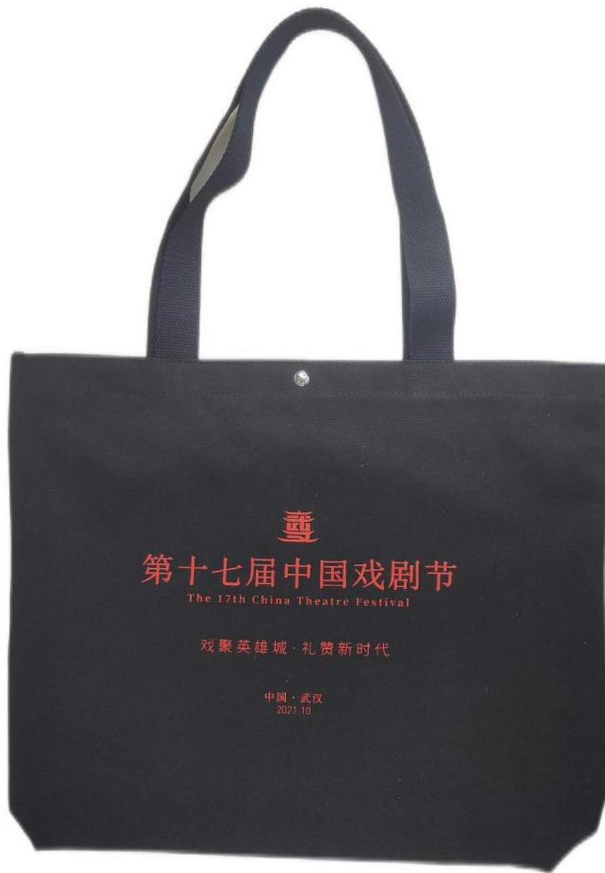
Screen Printing & Thermal Transfer Printing